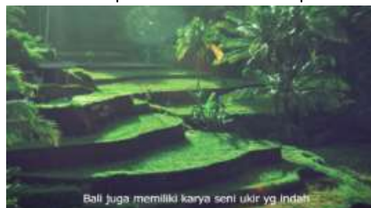
Figure 6. Scene of the island of Bali

Showing views of the island of Bali with its natural beauty as the opening of a documentary film which uses the point of view technique.