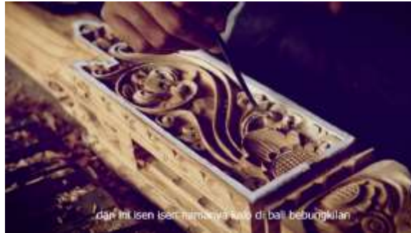
Figure 9. Scene of the carving results