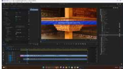
Figure 4. Video stabilization process