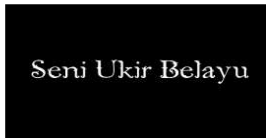
Figure 5. Initial Scene

Showing the title of the documentary film entitled Belayu Carving Art. using effect scale zoom in.