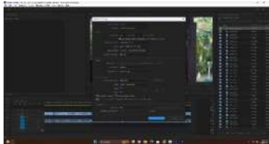
Figure 3. Sequence settings