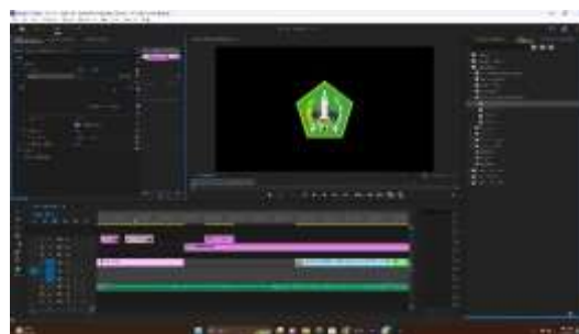
Figure 4. Addition of the District logo. Tabanan