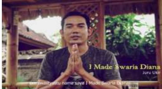
Figure 7. Scene about the source

Presenting resource person 1 introducing himself and explaining how he started learning to carve and explaining where the carving was carried out, taking pictures using the eye level technique. In the edit, I added color grading tale orange.