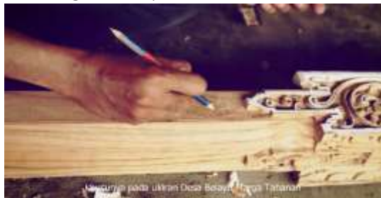
Figure 7. Scene of the carving process

Showing the process of making carvings in Belayu Marga Village, Tabanan, using the Overhead Angle Level shooting technique. In the edit, I added color grading tale orange.