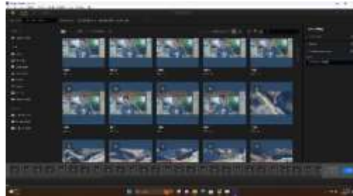
Figure 2. video selection and importing videos