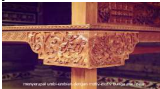
Figure 8. Scene of typical carving characteristics

Presenting resource person 1 explaining the characteristics of the carvings in Belayu Marga Tabanan Village, which uses eye level shooting techniques. In the edit, I added color grading tale orange.