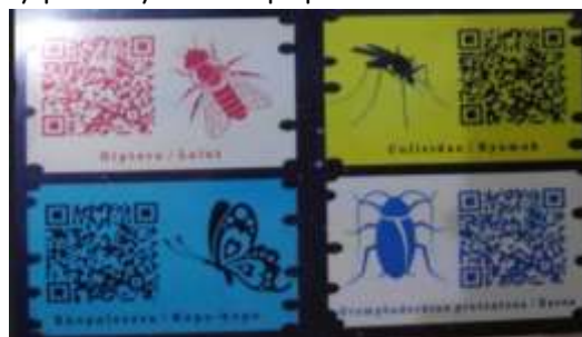
Figure 1. Animal Recognition Qr-Code Media

Students demonstrate autonomous information retrieval skills on digital platforms. Students utilize their smartphones to scan the QR-Code shown on the media. A hyperlink will be displayed to offer additional information pertaining to animal identification. The listed animals are commonly met by pupils in the nearby surroundings. Through careful observations, it has been determined that every student has successfully demonstrated the ability to autonomously utilize the QR-Code Media and do online searches using cellphones. This demonstrates the high usability of the QR-Code Media, as it can be effortlessly utilized even by primary school pupils.