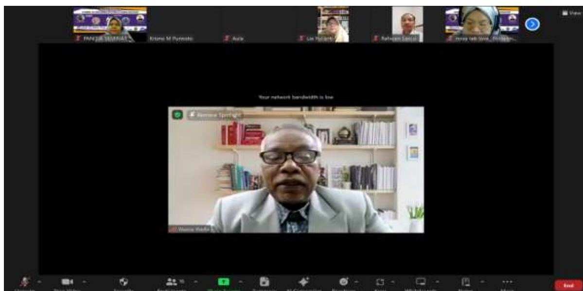
Figure 1. Keynote Speech and Opening