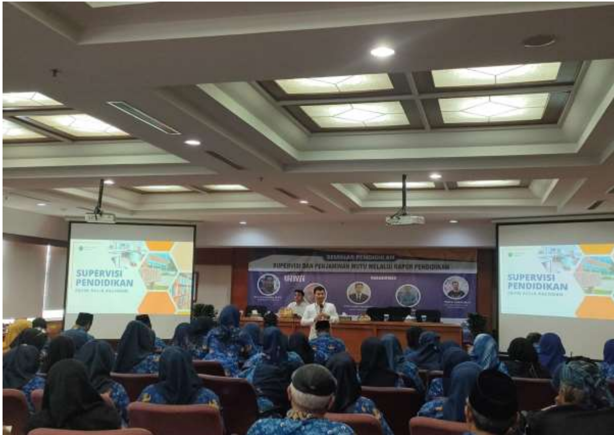
Figure 2. Delivery of Material

This seminar material provides practical provisions so that elementary school principals can easily carry out supervision and quality assurance through analysis of education reports as a basis for planning for the 2024-2025 academic year.